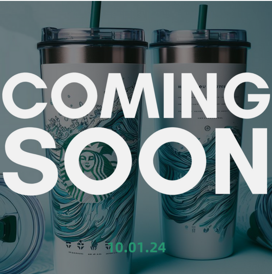
POST 1- TEASER