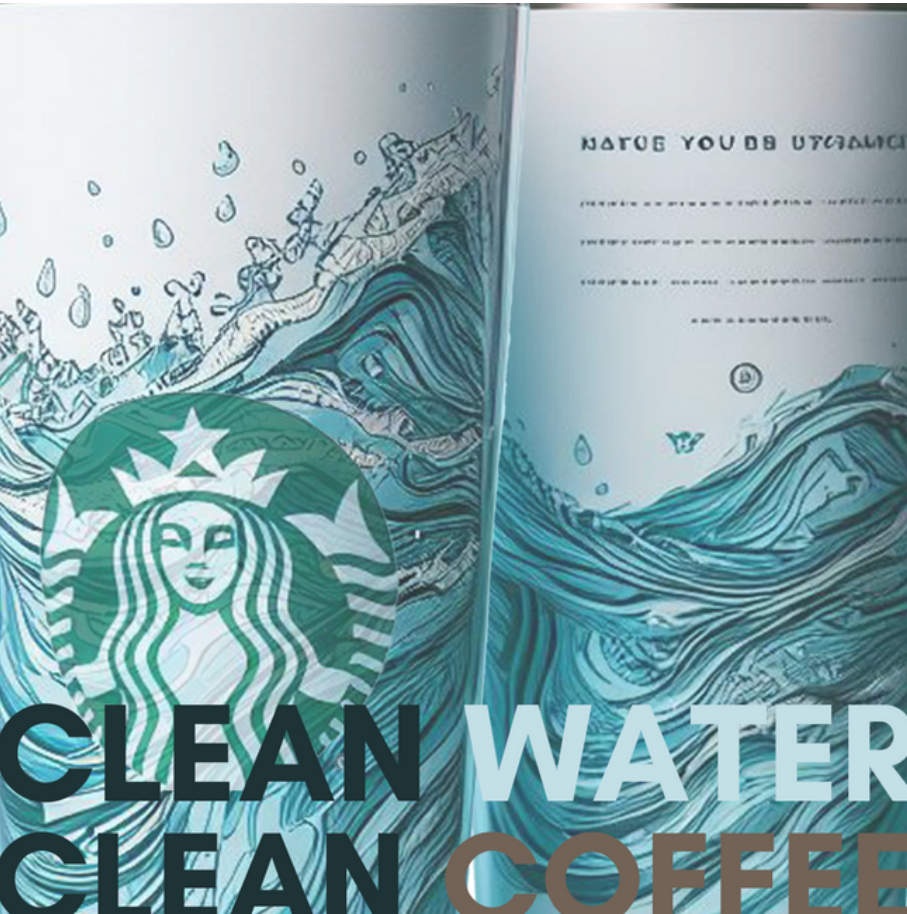
POST 2- PARTNERSHIP ANNOUNCEMENT